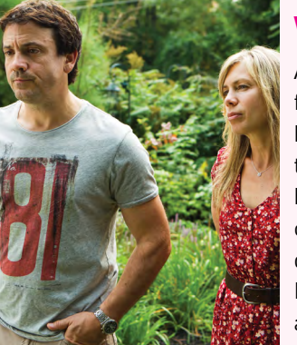
THE ODDS Em Broadcaster: TVA, Canada // Episodes: 50 x 30 mins

4 small-town friends change their identities to get jobs at one of the world's top financial firms. They will fake it all to appear more sophisticated and achieve their fantasy of opening their own investment company. Will they keep their identities intact long enough to reach their goal?